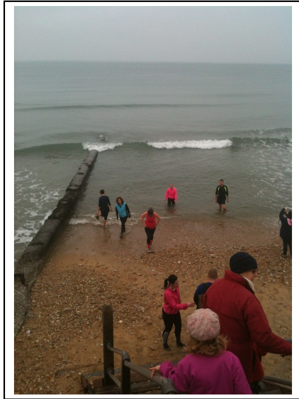
Now that looks cold! Runners at Charmouth last week